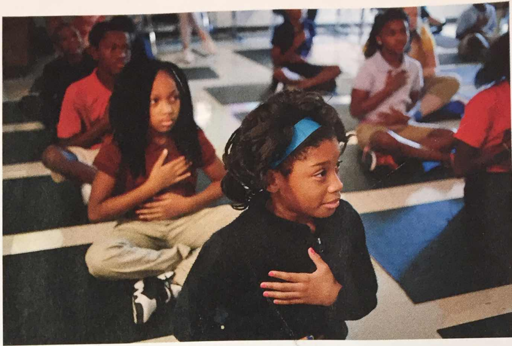
Over the next two years, the Compassionate Schools Project aims to study kids in 50 Louisville public schools

Calif., that trains teachers in mindfulness.